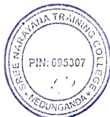
PRINCIPAL Sree Narayana Training College Nedunganda, Pin: 695307