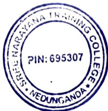
PRINCIPAL Sree Narayana Training College Nedunganda, Pin: 695307

‡Introduced vide Amendment (No. 12) to the Pension Statutes Notification No. Acad. L/PS/11/84 dated 28-11-1984, effective from 22-9-1984.